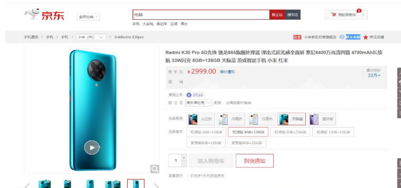
Figure 2: JD chinese e-commerce website

It was collected from Jing Dong (JD website) it is known as B2C e-marketing website, see Figure 2, the features depend on was (price, average rating, and some reviews, on-shelf date, rating, and date of the most recent review). The features are divided into three parts of products features: static-like (price, brand, and so on), dynamic (average rating and seals), and certain product features like (size, color, and so on).